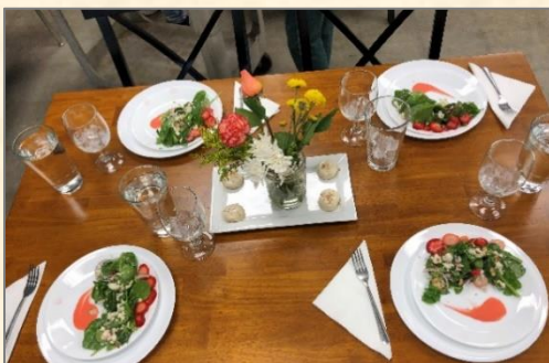
Special meal prepared by Donaldson Culinary students.