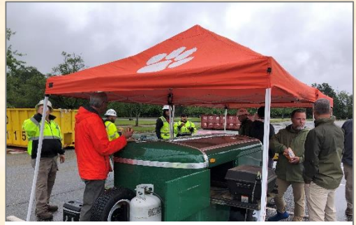
Food Truck visits Hillcrest High School