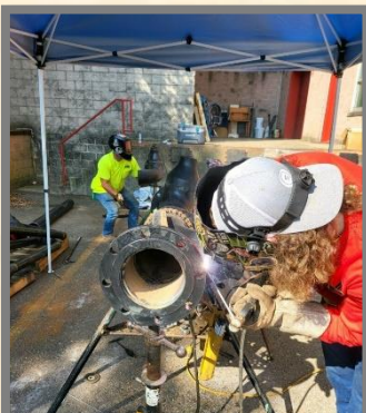
West End Elementary School