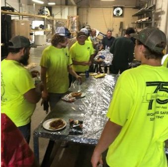
Serving in the Shop

When we envision summertime, we often think of the “lazy days.” Life moves a little slower; families take vacations; Saturdays are spent at the pool or the ballfield.